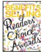
Best Vision Coverage