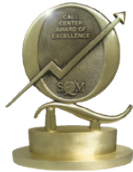
World Class Member Service